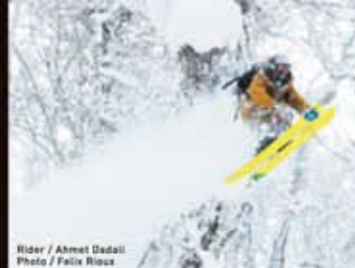
Rider / Ahmet Dadali